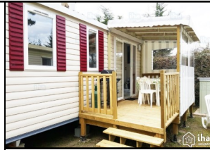
Sample of a "manufactured home."

real property. The words "mobile home" and "manufactured home" are synonymous for the purposes of this Act. Any such structure located outside of a mobile home park shall not be construed as chattel, but must be assessed and taxed as real property as defined by Section 1-130 of the Property Tax Code."