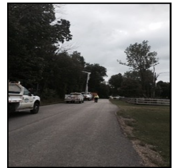
Chip Sealing a Road - Road crews remove dead trees and brush.